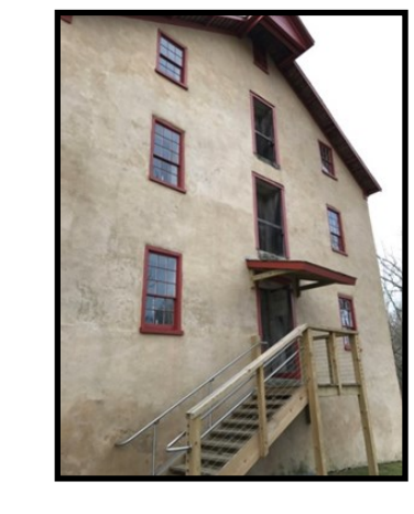
Ralston Cider Mill, Mendham Township

A $7,725 grant to the Ocean Grove Historic Preservation Society, Inc. will help fund new security cameras and upgrades to the security system.